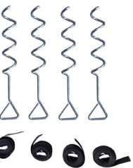
Tie Down Kit $49.00